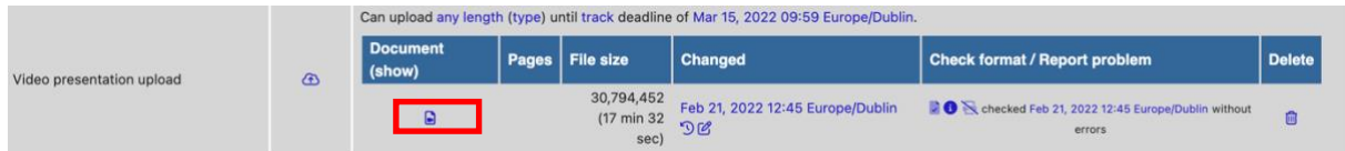
Figure 5: Click “Document (show)” to playback video.

To check your upload you can click on “Document (Show)” on the paper page and you can check the video playback.