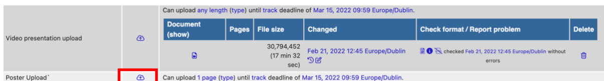
Figure 6: Click on cloud icon beside Poster Upload

The interface for uploading a poster is similar to that for uploading manuscripts (figure 7). The poster must be in A0 portrait in pdf format. It is understood that when uploading your presentation video or poster that you accept the terms and conditions specified in item 4) of the copyright form you uploaded to EDAS with your original manuscript submission.