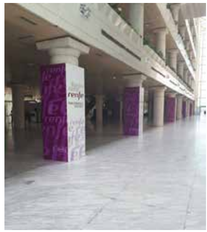
EuCAP2022 - THE VENUE: IFEMA PALACIO MUNICIPAL